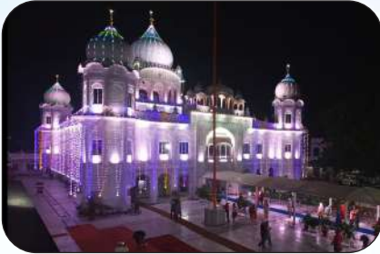
NADA SAHIB GURUDWARA