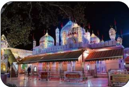
MANSA DEVI TEMPLE