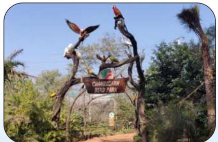
CHANDIGARH BIRD PARK